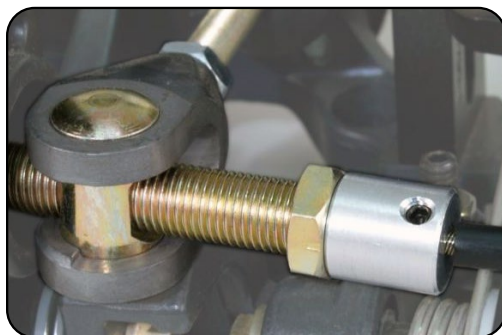
Bias Adjuster attached

Route the remote bias adjuster cable in a manner that will not interfere with the throttle pedal throughout the full brake pedal stroke range. This is very important to prevent an application of the brakes from depressing the throttle pedal. Secure the cable to the chassis, in a manner that limits the number (and degrees) of bends in the cable and allows the adjuster to operate smoothly.