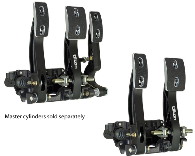
Master cylinders sold separately