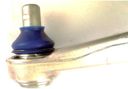
Figure 2: Roll centre ball joint assembled in control arm