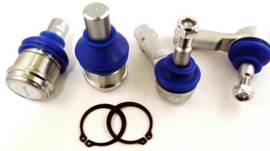
Figure 1: Kit contents