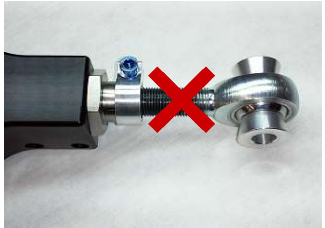
Overextended rod end.