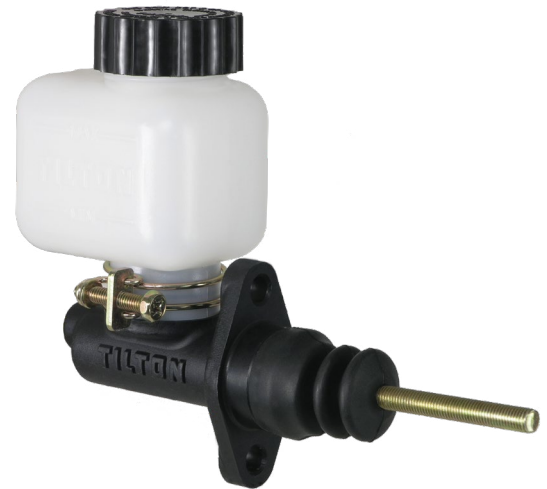
Diagram 1 - Master Cylinder Kit and Replacement Parts

May not be suitable for use with some ABS (anti-lock braking) systems due to the high pressure pulsations that they may send back to the master cylinder, potentially damaging the high-pressure seal.