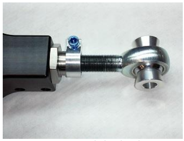
Overextended rod end.