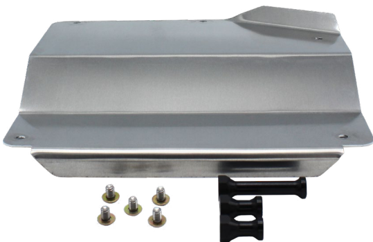
Optional false floor kit (72-853-FF)