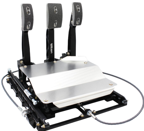
72-850 included false floor