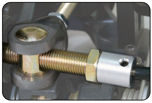
Bias Adjuster attached

Route the remote bias adjuster cable in a manner that will not interfere with the throttle pedal throughout the full brake pedal stroke range. This is very important to prevent an application of the brakes from depressing the throttle pedal. Secure the cable to the chassis, in a manner that limits the number (and degrees) of bends in the cable and allows the adjuster to operate smoothly.