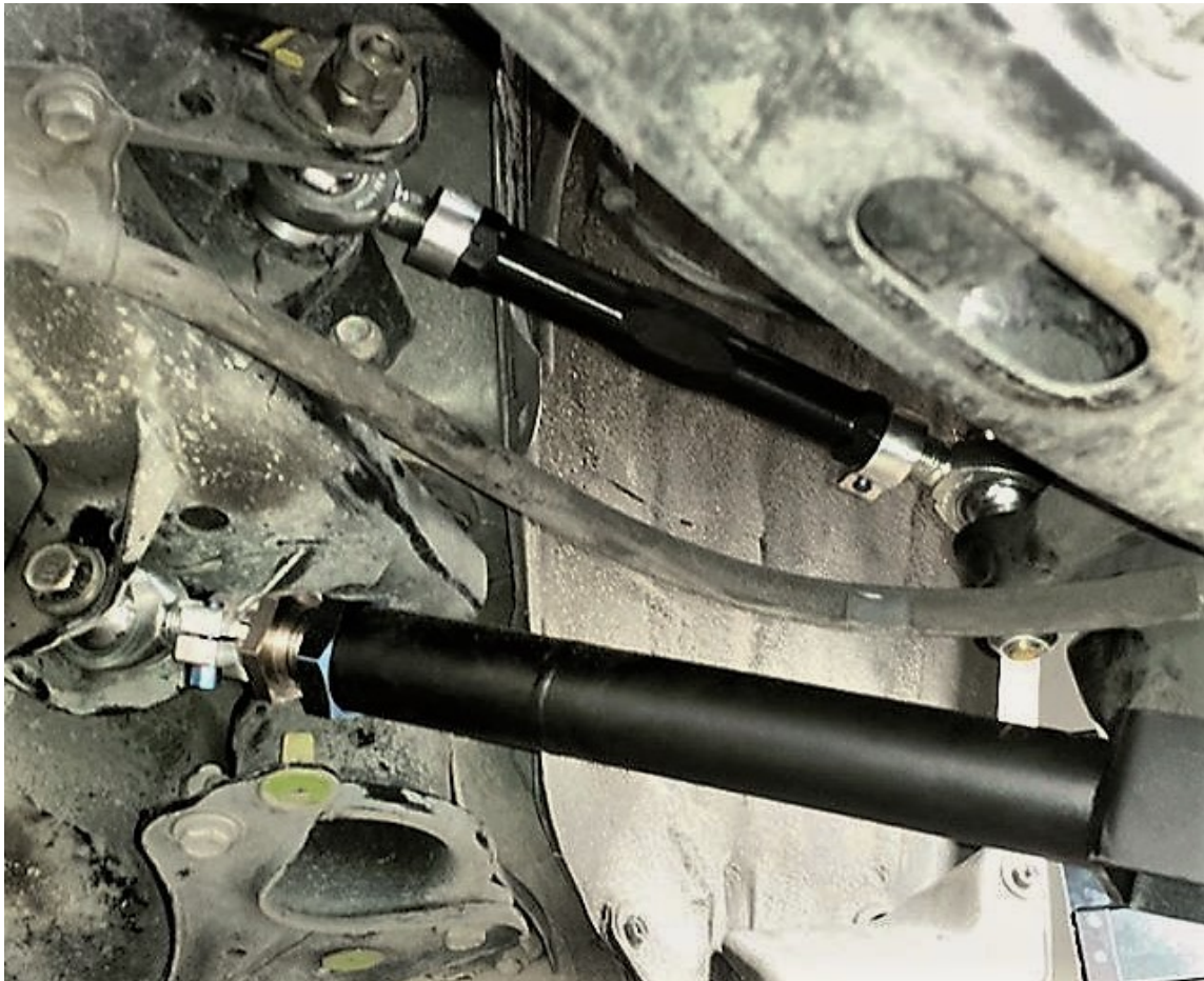
A view of the installed traction arm with our rear toe arm installed above.