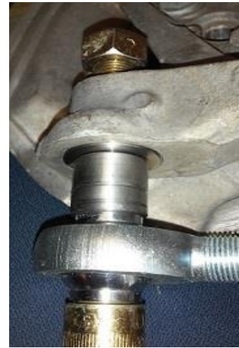
When tight, the conical spacer should be flush.