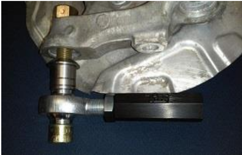
Make sure the conical spacer is in proper position.

1/2" allen wrench 15/16" socket 21mm wrench crescent wrench or 7/8" open ended wrench Torx heads for stock tie rod pinch bolt, size varies